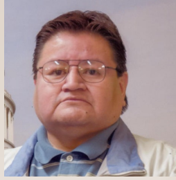
Richard J. Arthur Chair